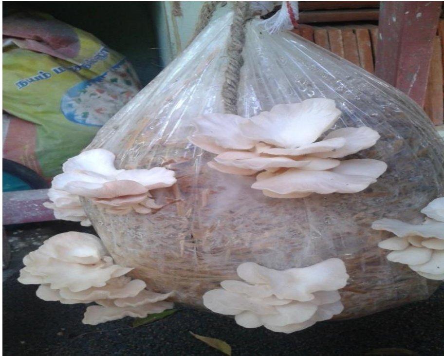
Plate:2 Harvested Mushroom